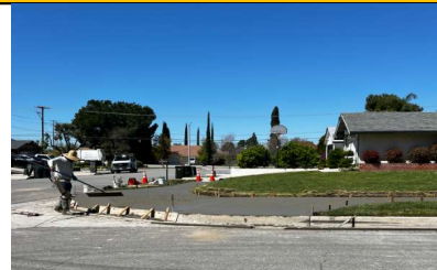
The contractor placing concrete northwest corner of Pedley Street and Raemee Avenue.

Construction notices have been given to affected residents. If restricted parking is necessary, "No Parking" signs will be posted 48 hours in advance of construction activities.