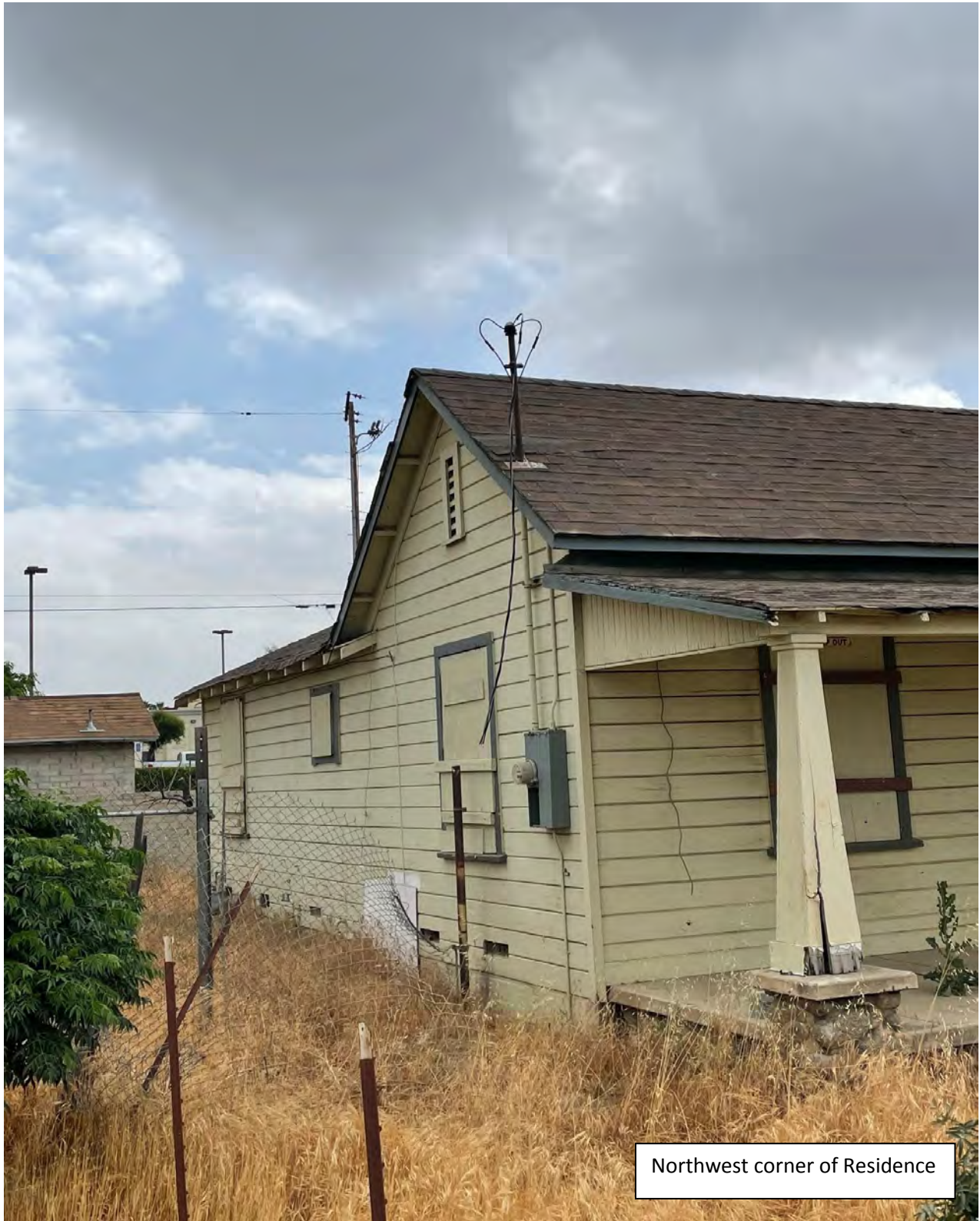
Northwest corner of Residence