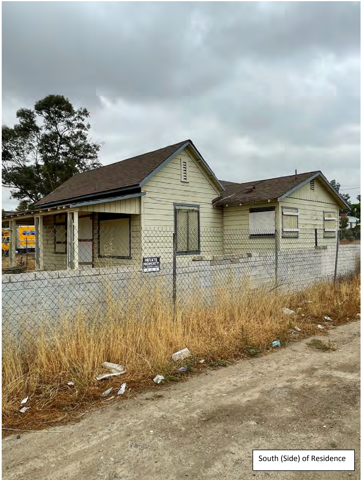
South (Side) of Residence