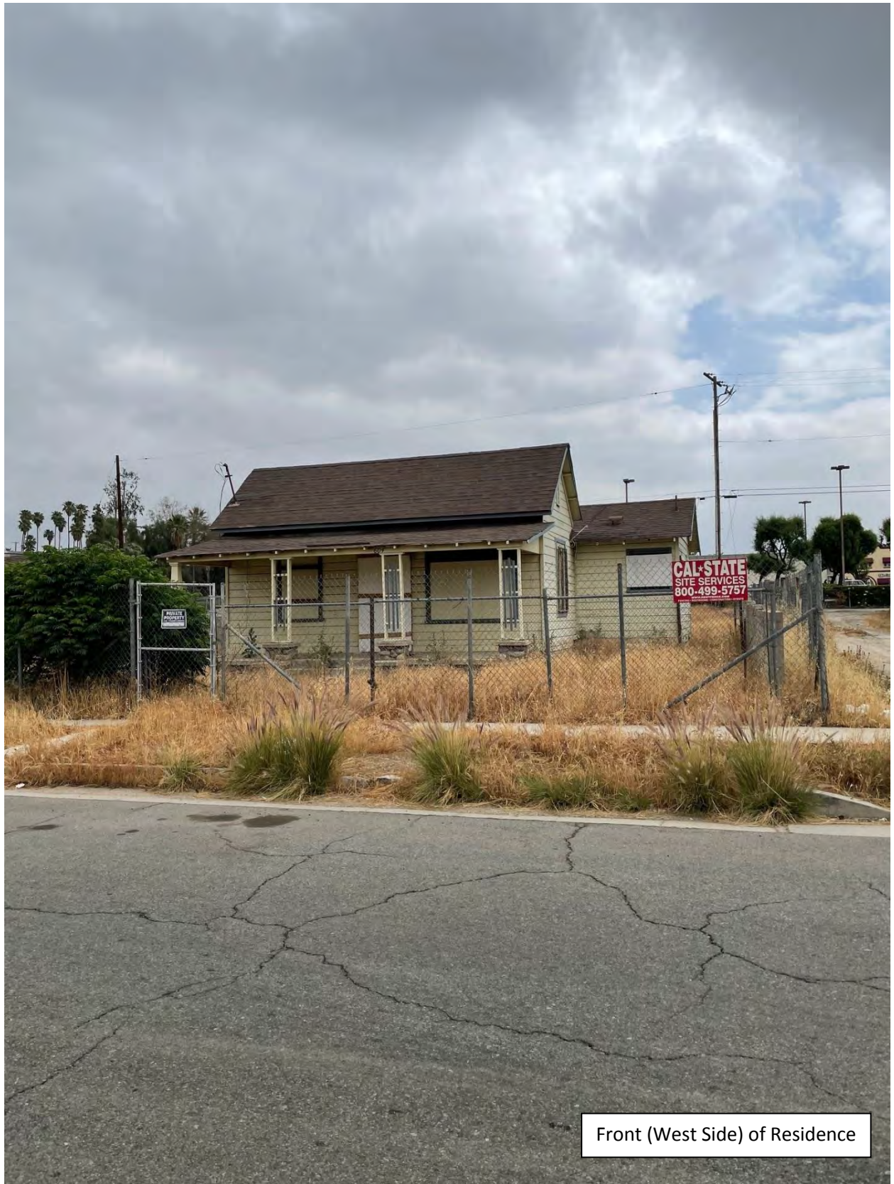
Front (West Side) of Residence