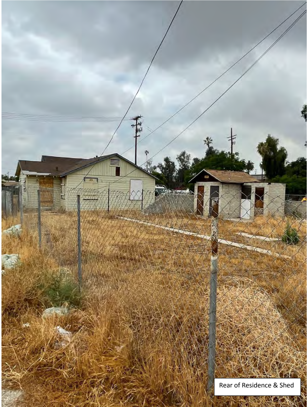
Rear of Residence & Shed