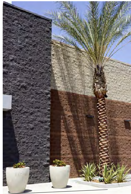
MASONRY TEXTURE PATTERN AND COLOR