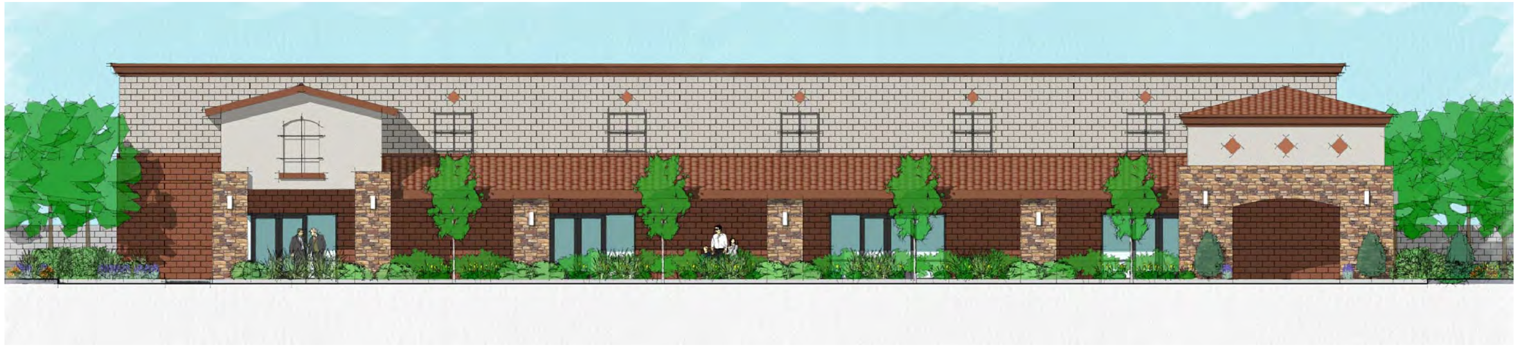
SOUTH ELEVATION - VIEW FROM PARK AVENUE