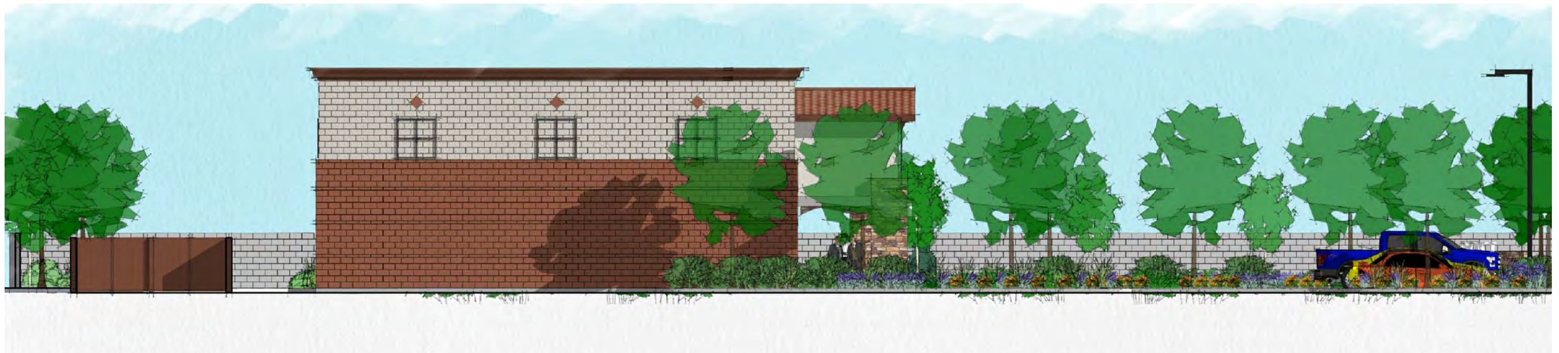
WEST ELEVATION - VIEW FROM INTERIOR LOT LINE