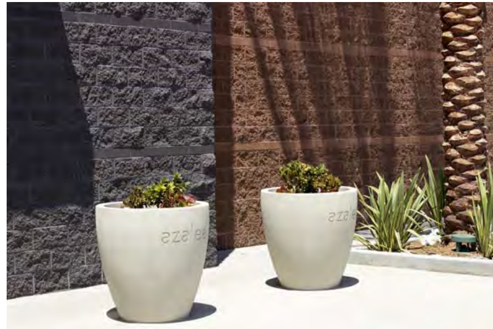
ENLARGED TEXTURE PATTERN