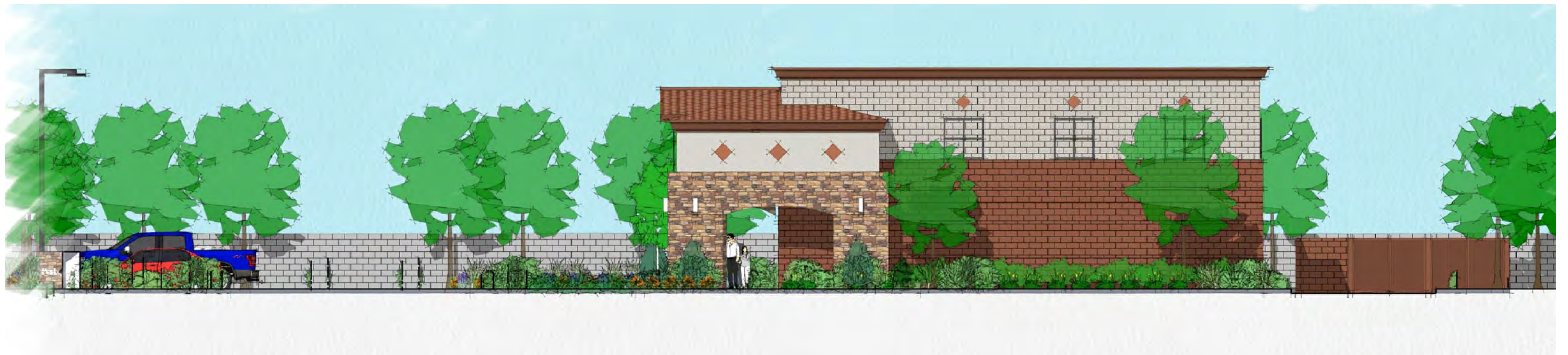
EAST ELEVATION - VIEW FROM IOWA STREET