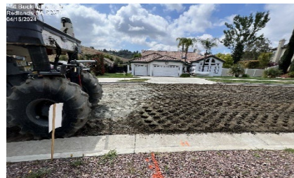
Cement treatment of subgrade on Buckingham Dr

There is a variety of work currently being done throughout the City associated with this project. Residents should expect minor delays. Drivers should adhere to posted signs and use proper precautions. If restricted parking is necessary, "No Parking" signs will be posted 48 hours in advance of construction activities.