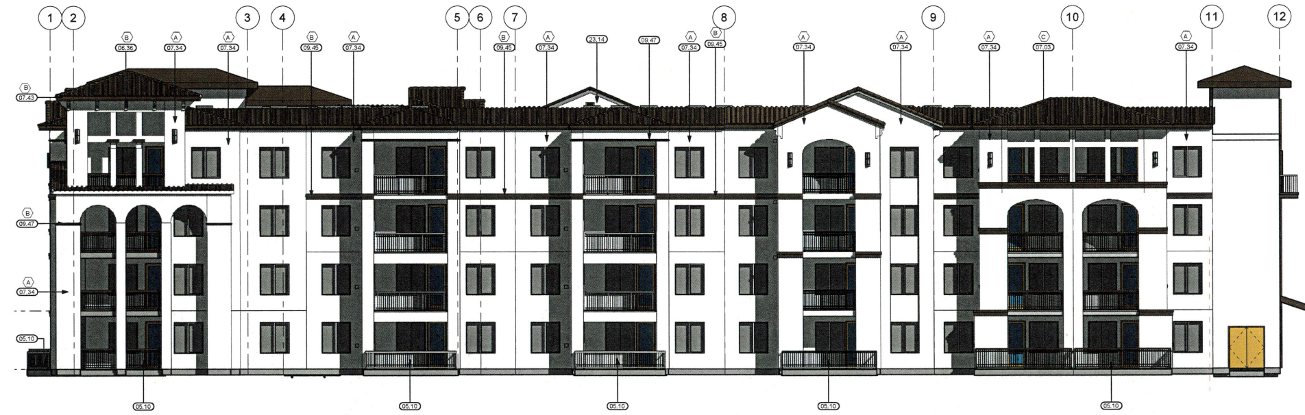
North - Colored